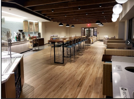
On-Site Café with office catering available