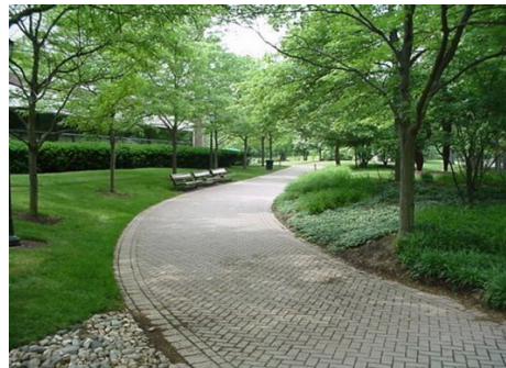
Walking Paths & Greenway